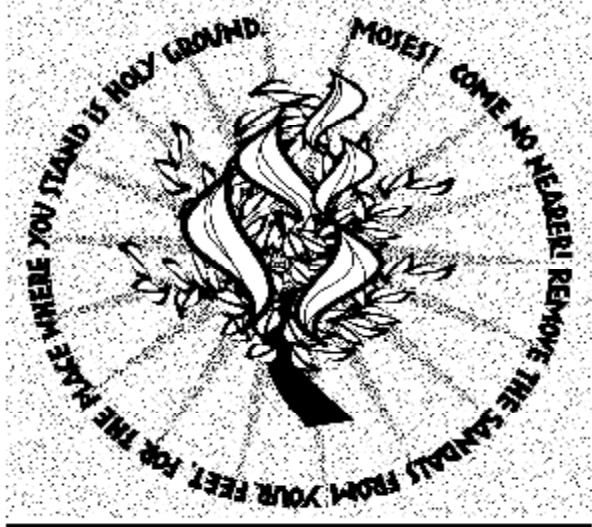
AN ANGEL OF THE LORD APPEARED TO MOSES IN FIRE FLAMING OUT OF A BUSH